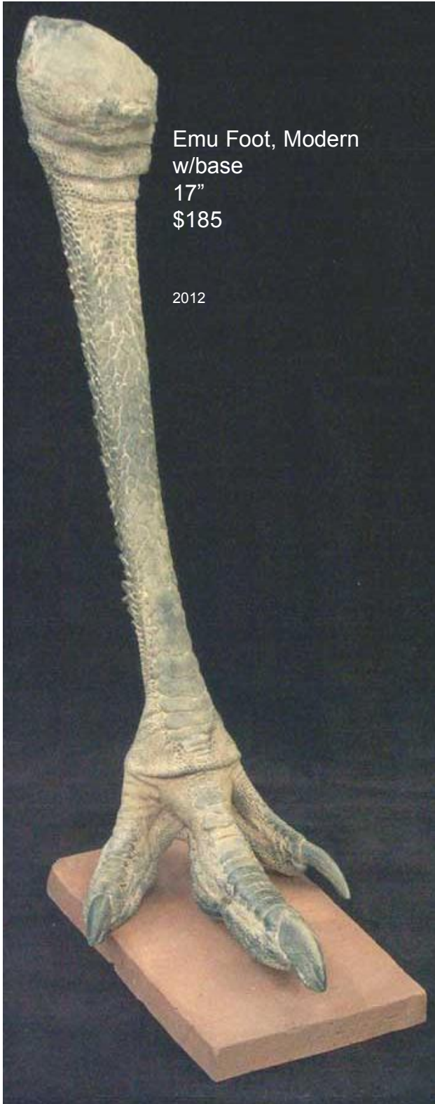
Emu Foot, Modern w/base 17" $185