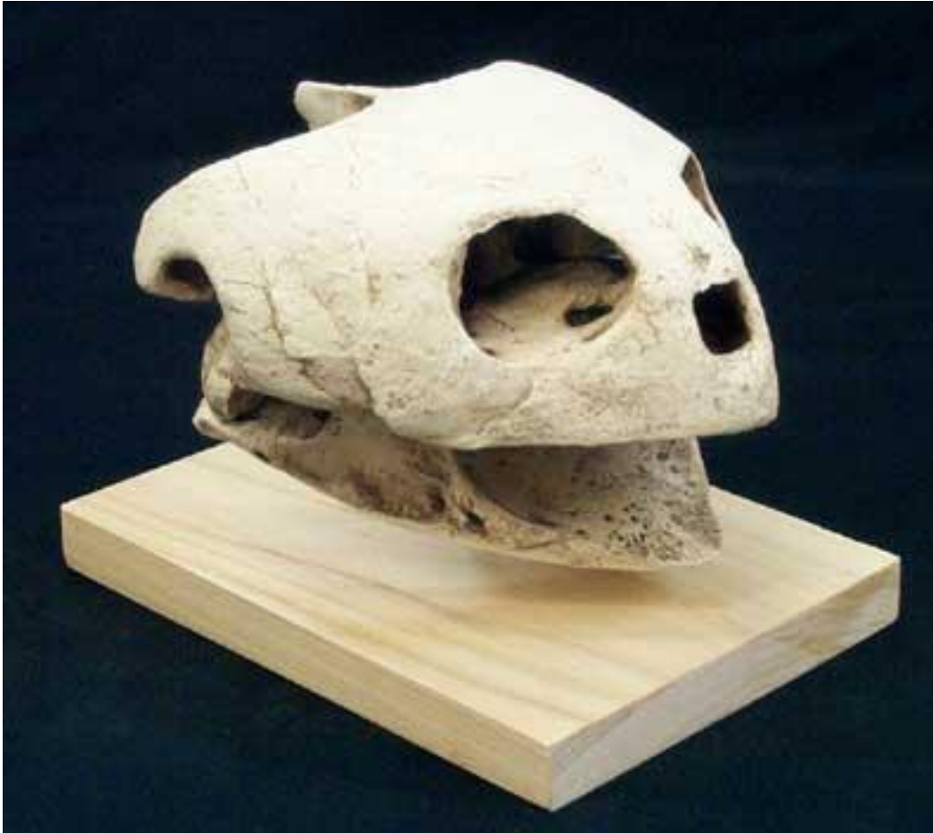
Giant Sea Turtle Skull with base, 6.7", $165 Scientific Name: Gafschelys sp. Location: Morocco Formation: Tegana Age: Early Eocene, 50-55 MYA