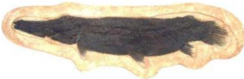
Giant Gar Fish Lepisosteus atrox : Measurements: 5' 5"