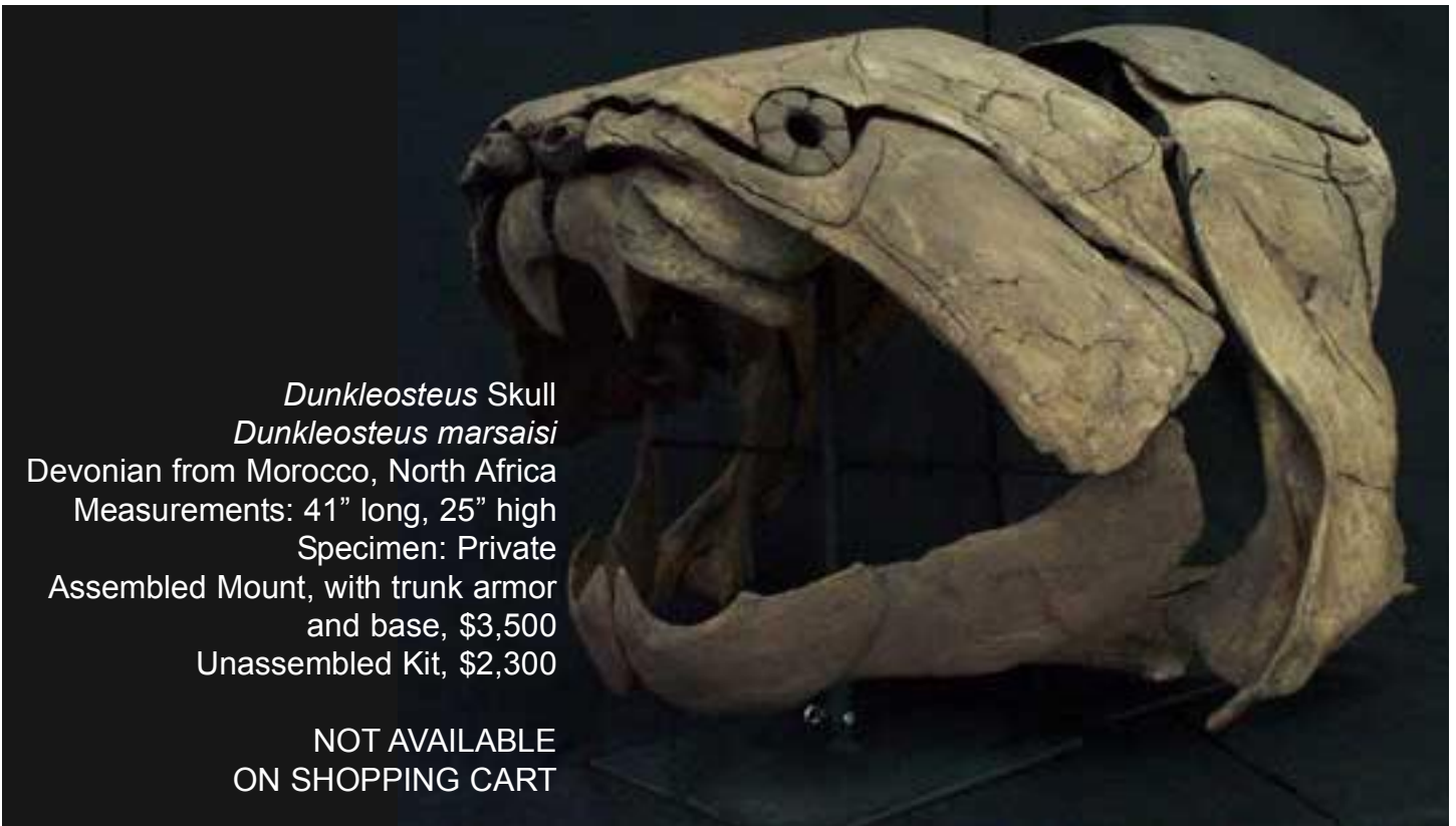
Dunkleosteus Skull Dunkleosteus marsaisi Devonian from Morocco, North Africa Measurements: 41" long, 25" high Specimen: Private Assembled Mount, with trunk armor and base, $3,500 Unassembled Kit, $2,300