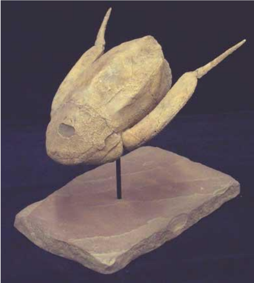
Bothriolepis Armored Fish