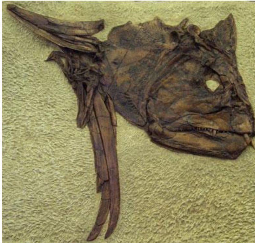
Xiphactinus fish, 29.5 x 27," $575 Scientific Name: Xiphactinus audax Location: Kansas, USA Formation: Niobrara Age: Late Cretaceous, 80 MYA